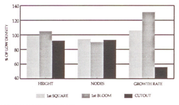
BELTWIDE MONITORING PROJECT, 1992

The presentation of average trends suggests that the impact of density on growth and development is straightforward. This is an oversimplification. The interplay between the availability of moisture, nutrients, light and temperature create an array of possible responses. Soils with high fertility and moisture availability will tend to produce abundant vegetation. Leaves deep in the canopy may not be sufficiently illuminated to support the development of the earliest bolls. The resulting boll shed stimulates the growth rate, promoting rankness. Boll loading may be delayed until the blooms progress up the stalk into areas with more available sunlight.